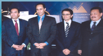
Launch of the new market